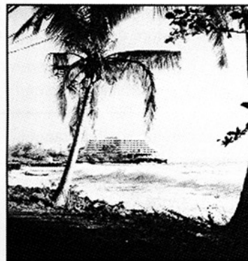
Pierce photographed Hawai'i Island through its many transitions in the 1960s. Below: The evolving Kona landscape, before (1966) and after (1968) the construction of the Kona Hilton Resort (later known as the Royal Kona Resort).