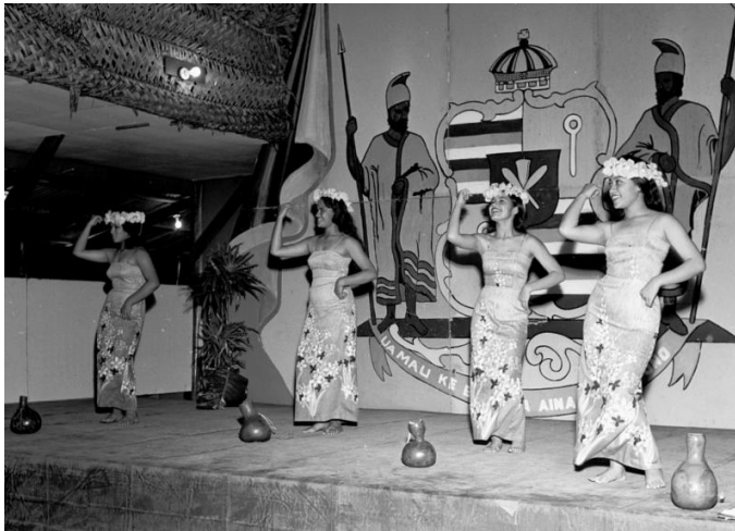
This is the nineteenth in a series of images from the Pierce Collection that we are sharing with our members in The Journal .

This photo was taken on January 24, 1967.