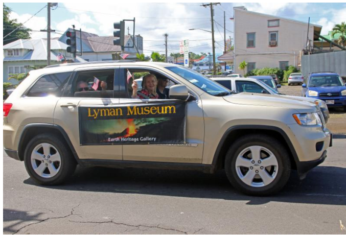
The Museum salutes our veterans in the 2016 Veterans Day Parade!

Lyman Museum, 276 Haili St, Hilo, HI 96720