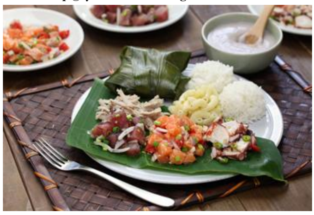
Lyman Museum Participates in 2016's Museum Day Live! Presented by the Smithsonian Institution

The Lyman Museum will open its doors free of charge on Saturday, September 24, as part of Smithsonian Magazine's twelfth annual Museum Day Live! On this day only, participating museums across the United States emulate the spirit of the Smithsonian Institution's Washington, D.C.-based facilities (which offer free admission every day), opening their doors for free to those who download a Museum Day Live! ticket.