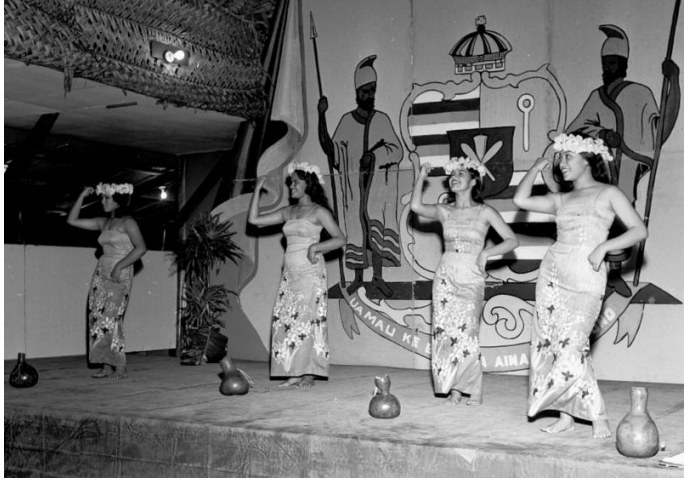
This is the nineteenth in a series of images from the Pierce Collection that we are sharing with our members in The Journal .

This photo was taken on January 24, 1967.