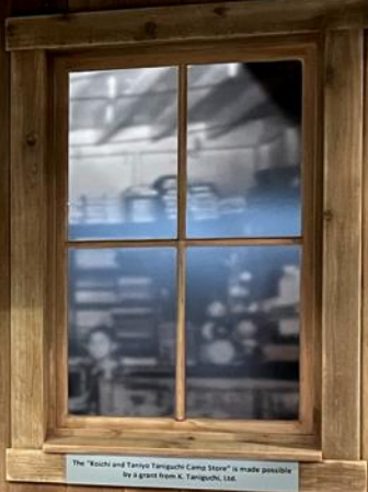
The "Kuchi and Tanyu Taniguchi Camp Store" is made possible by a grant from K. Taniguchi, Ltd.